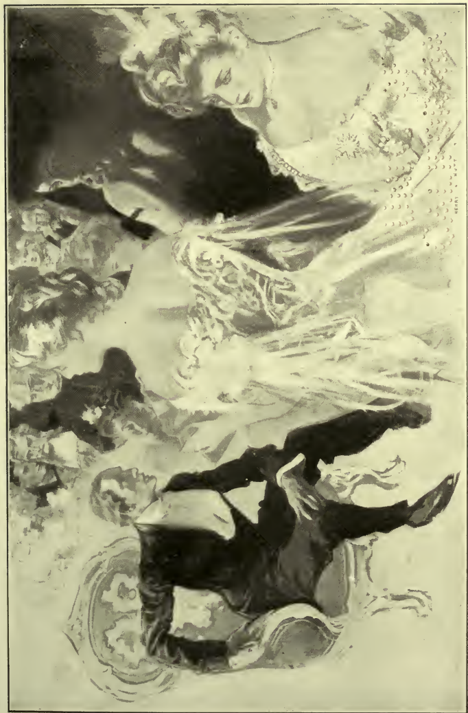
“The girl in black stood motionless, watching him intently.”