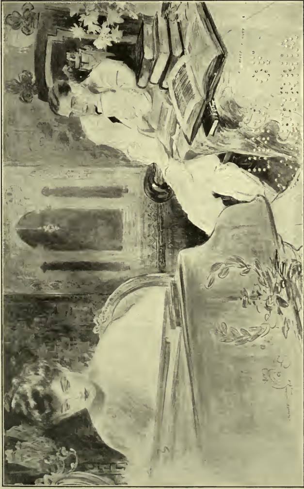
“She dropped her head, striking chord on chord with nervous precision.”