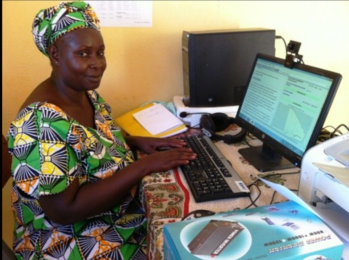
Wikipedia offline on a school computer in Mali