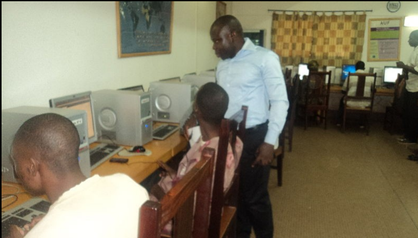
Training session on Wikipedia in Mali (organized every week)