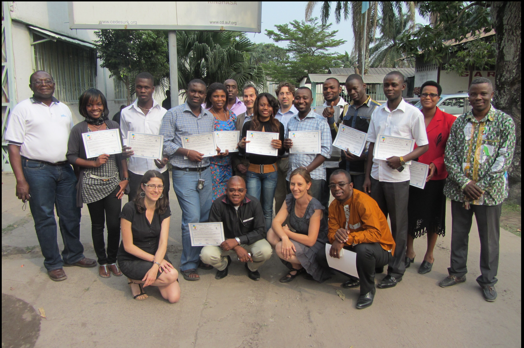
New wikimedians from Kinshasa ;-)