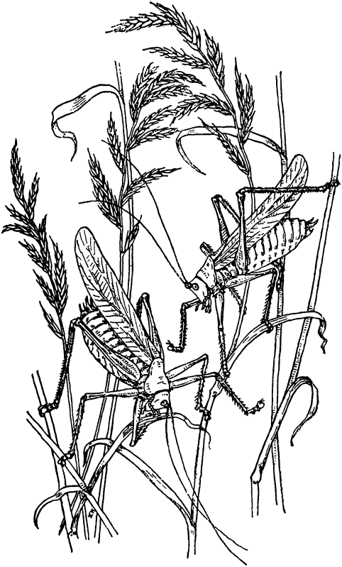
RIVAL GREAT GREEN GRASSHOPPERS