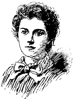
A HAMPSHIRE GIRL

types, as there are two in the blonde, and it will be understood that I only mean two that are, in a measure, fixed and easily recognised types; for it must always be borne in mind that, outside of these distinctive forms, there is a heterogeneous crowd of persons of all shades and shapes of face and of great variety in features. These two dark types are: