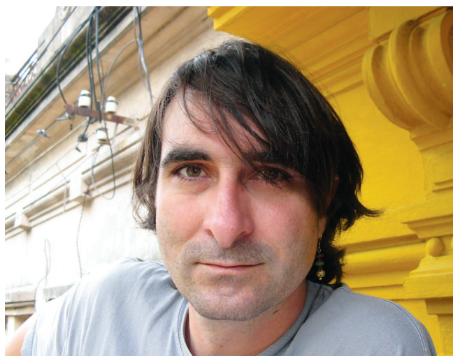
(CC-BY 3.0) by Ofelia Ros

It exceeded expectations in just about every area. I was perhaps most surprised by how much this also became an assignment about writing (and revising).